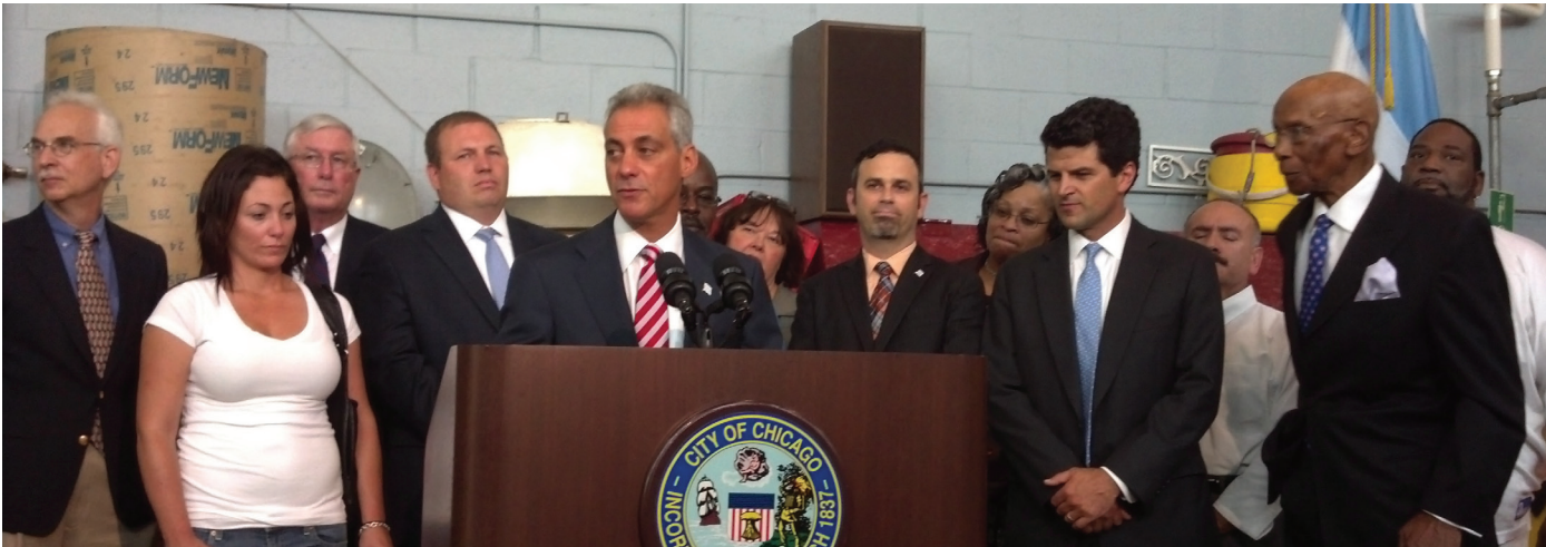
Watch the kick-off conference for the City of Chicago Program here: http://vimeo.com/46629498